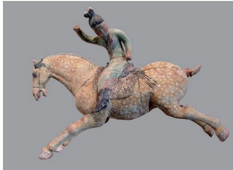
Clay statuette depicting Polo Player, Tang Dynasty